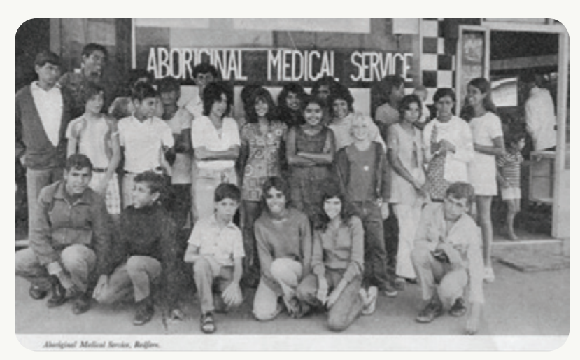
Above: First Aboriginal Medical Service Redfern 1971

The AH&MRC, formerly the Aboriginal Health Resource Co-op (AHRC), was established in 1985 following a recommendation of the Brereton Report by the NSW Aboriginal Task Force on Aboriginal Health in 1982-83. The Report recognised Aboriginal community control as a crucial element in laying the foundation for a better standard of health care for Aboriginal people. The role of the AH&MRC is to advocate, advise and support the ACCHOs in administering and improving holistic health outcomes for Aboriginal Communities. The first ACCHO was established in Redfern in 1971 and there are now more than 140 ACCHOs across Australia.