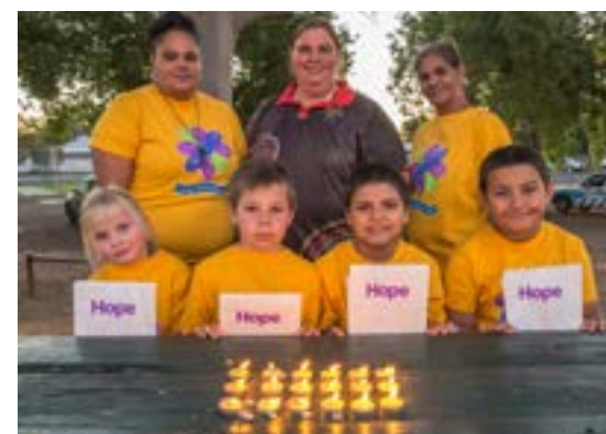
LEFT Lighting candles to help bring hope to Bourke cancer patients and their families