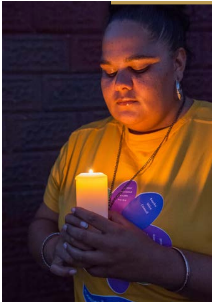
ABOVE Remembering those who have lost their lives to cancer