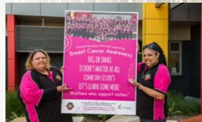
FAR LEFT Men show their support for breast cancer