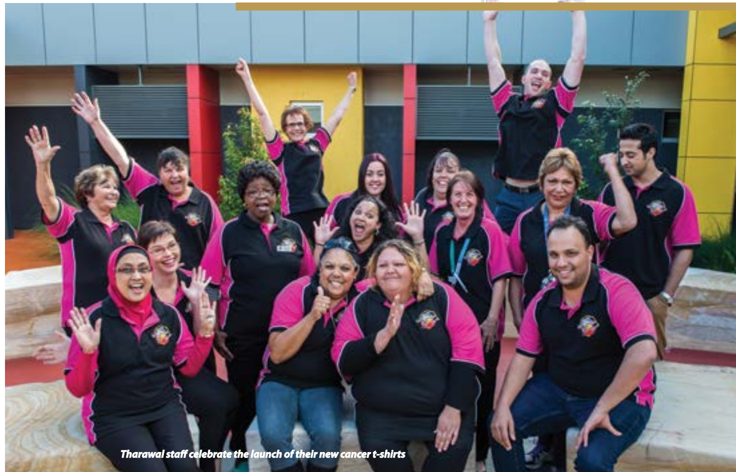
Tharawal staff celebrate the launch of their new cancer t-shirts

For most cancer support services, getting the prevention and early detection message out into the community is a high priority. Tharawal Aboriginal Corporation in Airds, South Western Sydney, recently came up with a unique way to not only spread the word about breast cancer screening